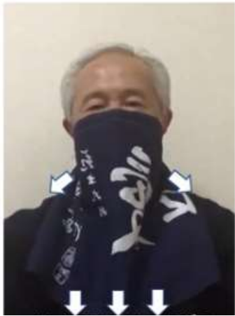
Air escapes downwards and sideways